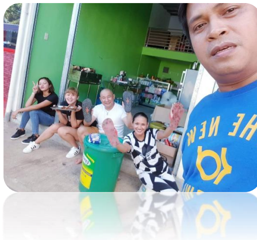
Tidy up completed, take a break! Commemorative photo with everyone in front of the store.