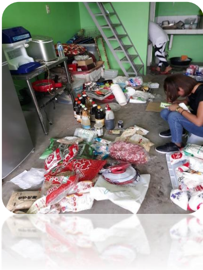
Inside the store ... Can we really tidy up?

There was a lot to prepare for the opening of the store in August.